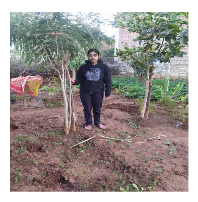
1. 2. WORLD FOREST DAY 2022

The world Day of Forests is celebrated each year to raise awareness about the importance of forests, woodlands and trees for the survival of humanity and the planet. It makes students aware of the contribution and significance of forests in balancing the life on earth.