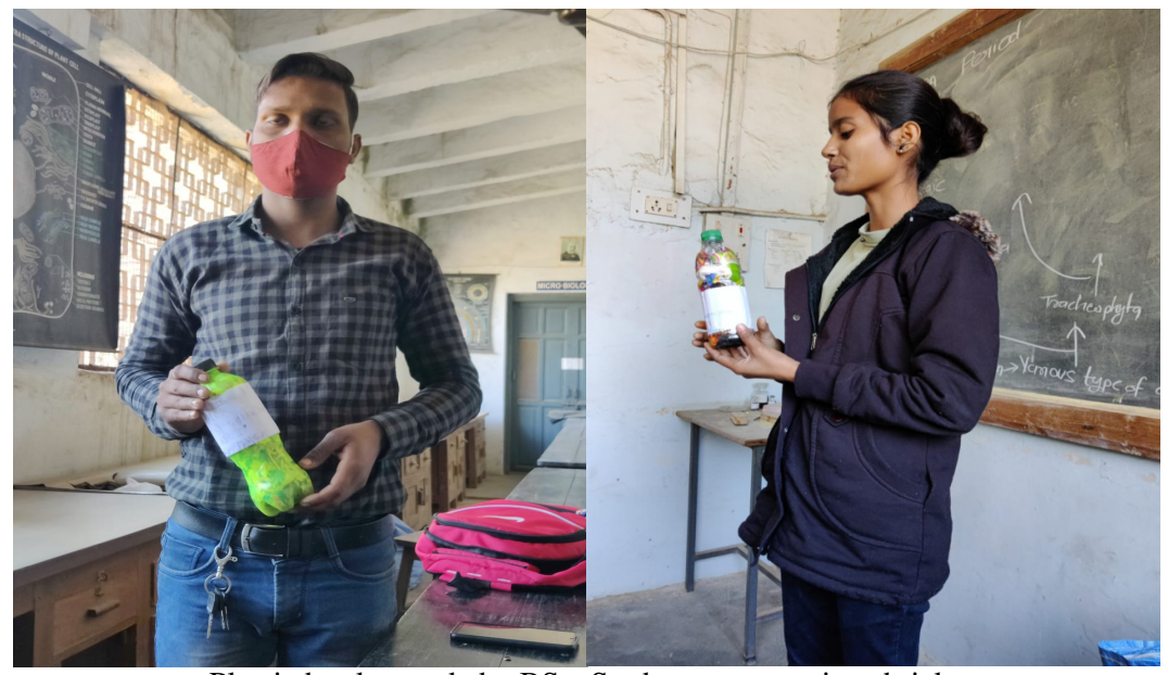
Plastic bottles made by BSc. Students to reuse it as bricks

Single use plastic is banned in College campus. We focusin bringing attention towards harmful effects of plastic on human and environment. We discourage the use of plastic products such as bottles, straws, utensils and food packaging materials.